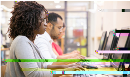
Libraries Build Business